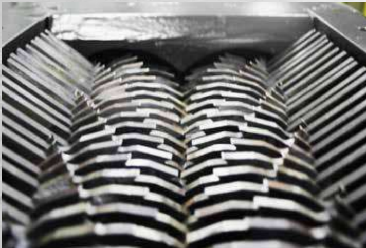
A Close View of The Cutters