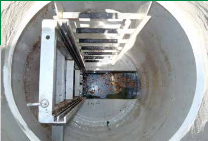
Guide Frame and Access Ladder Inside the M3 (the grinder has been removed)