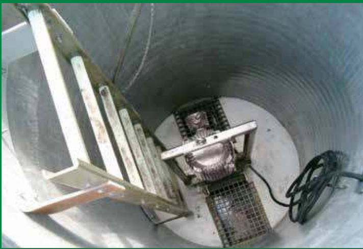
Top view of Muffin Monster Manhole