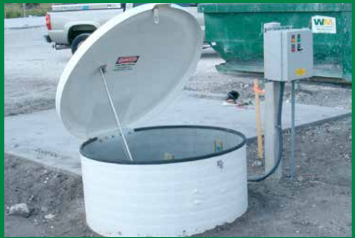
Hatch Access Door to M3 (street manhole option also available)