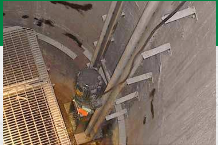
Guide Frame and Grinder