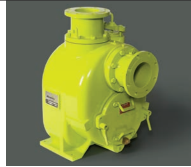
The Remko RT150 Trash Pump

RT Series Pumps are ideally suited for industrial applications including: steel and paper mills, abattoirs, mines, food and chemical processing plants, construction industry, dewatering, trade waste and sewage handling.