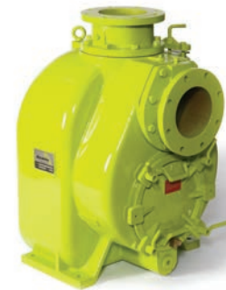
The Remko RT200 Trash Pump

RT Series Pumps are ideally suited for industrial applications including: steel and paper mills, abattoirs, mines, food and chemical processing plants, construction industry, dewatering, trade waste and sewage handling.