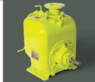
The Remko RTH100 Hi-Pressure Trash Pump

Dependable self priming performance makes the RTH Series Pumps ideally suited for industrial applications including mine dewatering, trade waste, metal and timber mills, road construction, food and chemical processing plants.