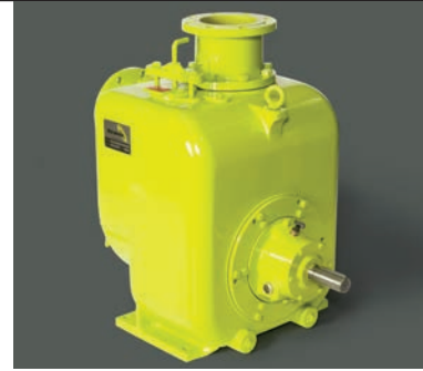
The Remko RTH150 Hi-Pressure Trash Pump

Dependable self priming performance makes the RTH Series Pumps ideally suited for industrial applications including mine dewatering, trade waste, metal and timber mills, road construction, food and chemical processing plants.